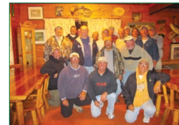
Fox River Valley Muskie Inc., Fox Valley, IL